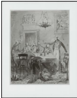
: PA-F00348-0005 Title: Scene the Second—The First Party