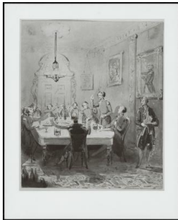
: PA-F00348-0015 Title: Scene the Seventh—The Mess Room