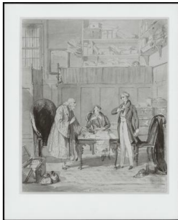
: PA-F00348-0013 Title: Scene the Sixth—The Usurer