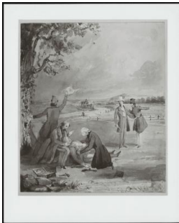
: PA-F00348-0017 Title: Scene the Eighth—The Duel