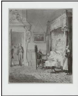
: PA-F00348-0019 Title: Scene the Ninth—The Sick Room