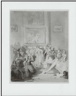
: PA-F00348-0007 Title: Scene the Third—The Right House