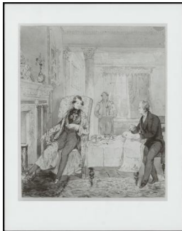
: PA-F00348-0003 Title: Scene the First—The Inheritance