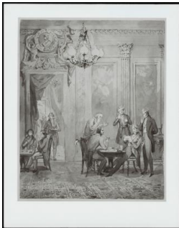
: PA-F00348-0011 Title: Scene the Fifth—The Gambling House