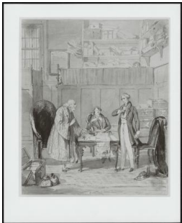
: PA-F00348-0013 Title: Scene the Sixth–The Usurer