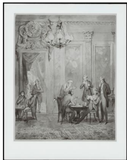
: PA-F00348-0011 Title: Scene the Fifth–The Gambling House