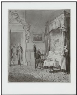
: PA-F00348-0019 Title: Scene the Ninth–The Sick Room