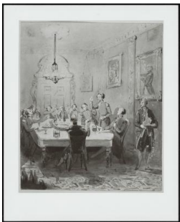
: PA-F00348-0015 Title: Scene the Seventh–The Mess Room