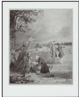
: PA-F00348-0017 Title: Scene the Eighth–The Duel