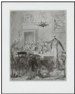
: PA-F00348-0005 Title: Scene the Second–The First Party