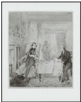
: PA-F00348-0003 Title: Scene the First–The Inheritance