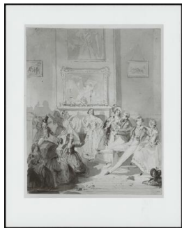
: PA-F00348-0007 Title: Scene the Third–The Right House