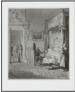
: PA-F00348-0019 Title: Scene the Ninth—The Sick Room