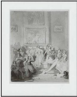
: PA-F00348-0007 Title: Scene the Third—The Right House