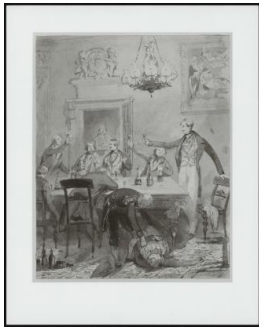
: PA-F00348-0005 Title: Scene the Second—The First Party