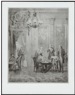
: PA-F00348-0011 Title: Scene the Fifth—The Gambling House