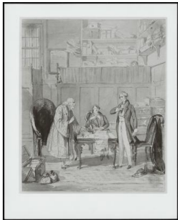
: PA-F00348-0013 Title: Scene the Sixth—The Usurer