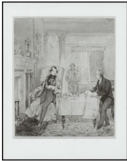
: PA-F00348-0003 Title: Scene the First—The Inheritance