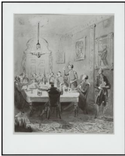
: PA-F00348-0015 Title: Scene the Seventh—The Mess Room