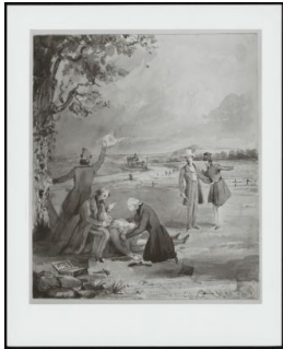
: PA-F00348-0017 Title: Scene the Eighth—The Duel