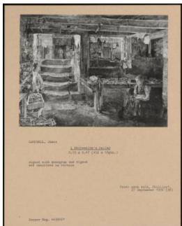
: PA-F06514-0007 Title: A Whitesmith's Cellar Provenance: Anonymous sale, Phillips, 27 September 1976 (98)