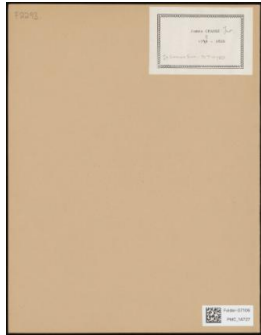
: PA-F07106 Title: PA-F07106