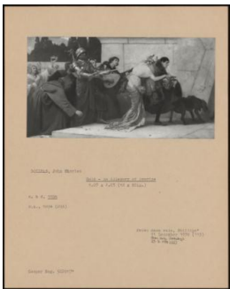
: PA-F03480-0003 Title: Gold - An Allegory Of Avarice Provenance: Anonymous sale, Phillips, 11 December 1978 (113), Anonymous sale, Sotheby's, 21 March 1984 (132)