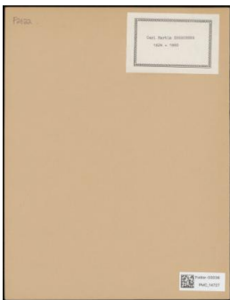
: PA-F03036 Title: PA-F03036