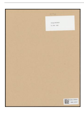
: PA-F00504 Title: PA-F00504