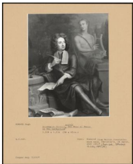
: PA-F07499-0003 Title: Arcangelo Corelli, Seated The Muse Of Music In The Background Provenance: Removed from Melton Constable; Anonymous sale, Christie's, 24 April 1987 (85), Anonymous sale, Sotheby's, 12 July 1989 (25)