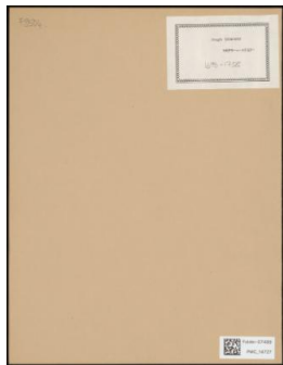
: PA-F07499 Title: PA-F07499