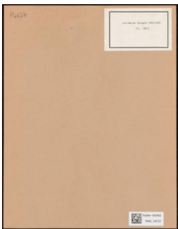
: PA-F04362 Title: PA-F04362