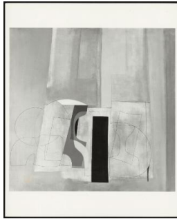
: PA-F01505-0007 Title: May 1955 (Gwithian) Provenance: Credit Line: Paul Mellon (1907–1999); Yale Center for British Art (B1985. 19. 2)