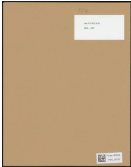
: PA-F01505 Title: PA-F01505