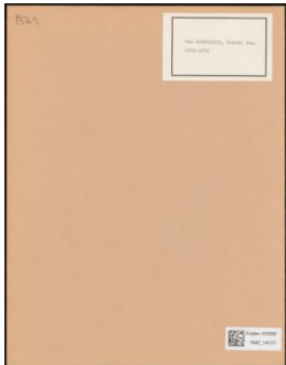
: PA-F02599 Title: PA-F02599