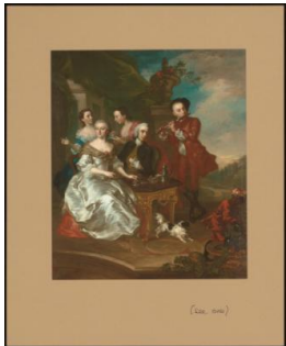
: PA-F02599-0011 Title: An Elegant Party Taking Coffee On A Terrace, A Formal Garden Beyond Provenance: Anonymous sale, Christie's London, 23 November 2004 (15)