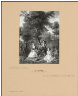
: PA-F02599-0009 Title: Fete Champetre Provenance: Anonymous sale, Sotheby's, 13 November 1996 (118)