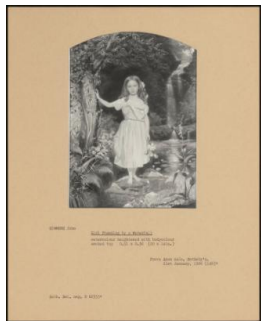
: PA-F05824-0003 Title: PA-F05824-0003