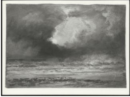
: PA-F00739-0003 Title: Sunset Seascape